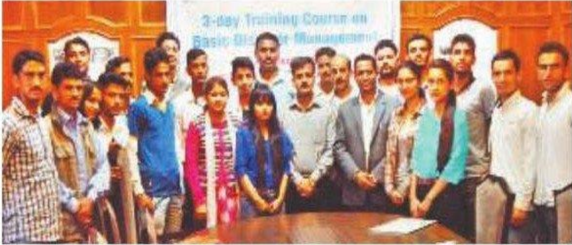
शिमला में तीन दिवसीय आपदा प्रबंधन प्रशिक्षण कार्यक्रम में भाग लेते अधिकारी तथा कर्मचारी।