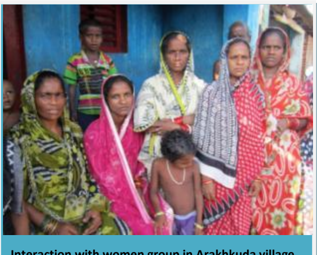
Interaction with women group in Arakhkuda village

As all the women & children were shifted to first floor, the male members stayed in downstairs with lots of fear. If, it is not possible to construct the cyclone shelter in more numbers, then equipments and emergency kits may also be kept in other