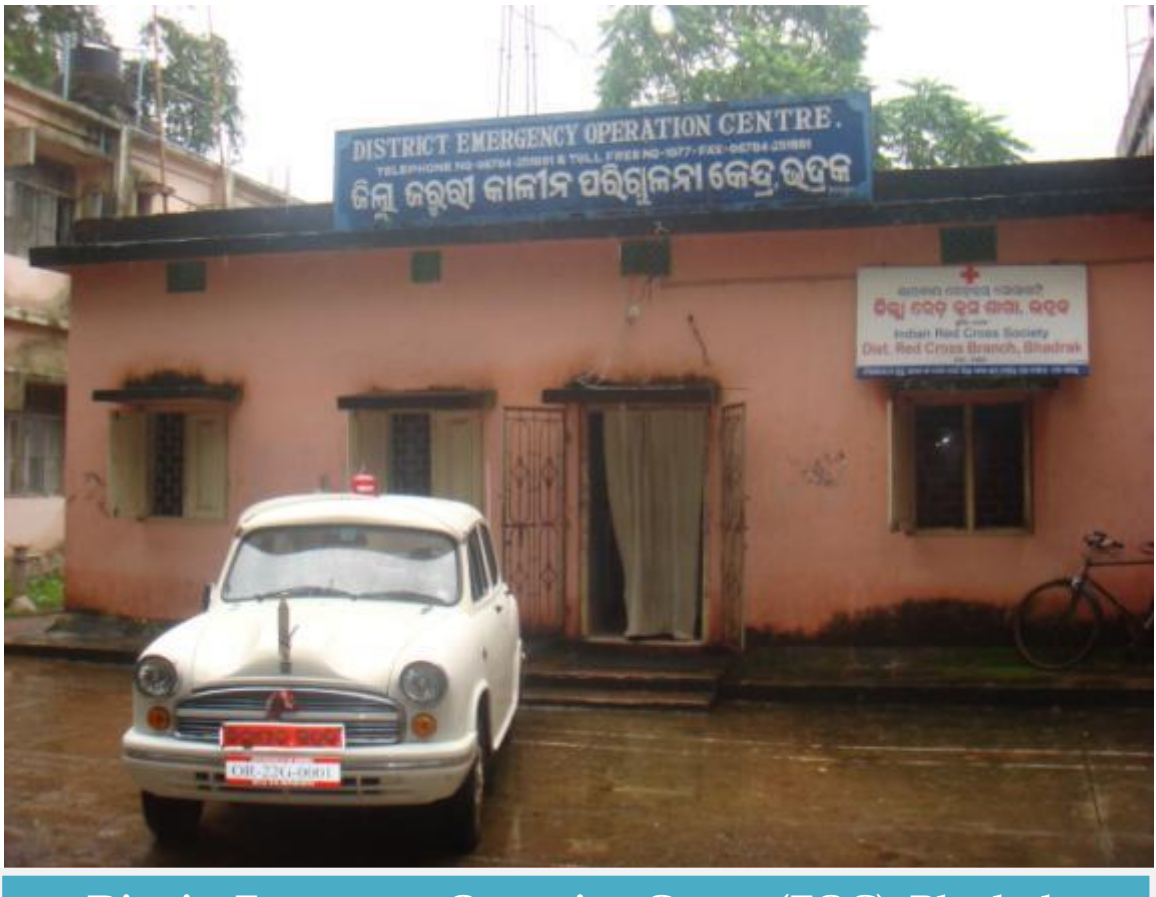
District Emergency Operation Centre (EOC) , Bhadrak

This district is surrounded by Balasore district and Bay of Bengal in the North, Kendrapada district in the East, Jajpur district and River Baitarani in the South and Keonjhar district in the West. The area of this district is 2505 Sq. Km. This district is divided into seven numbers of Blocks i.e. Bhadrak, Chandbali, Basudevpur, Bhandaripokhari, Bonth, Tihidi & Dhamnagar.