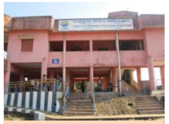
Multipurpose Cyclone Shelter, Arakhakuda