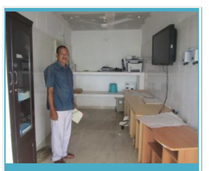
Communication Hub at Nardia-MCS, Ersama